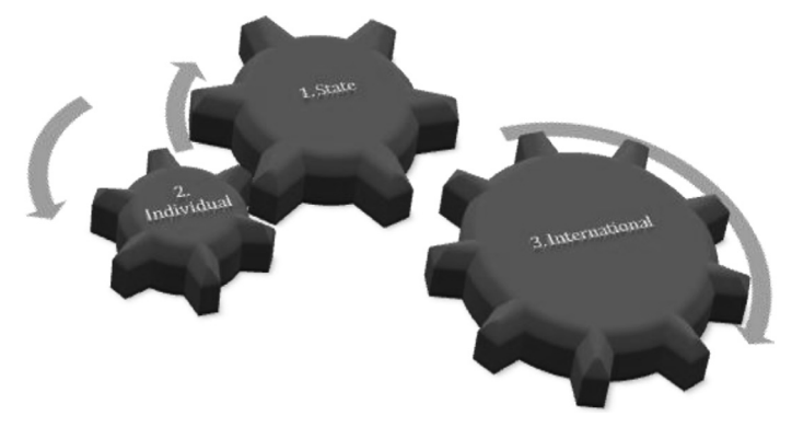
Figure 3. A Model of How Authoritarian Regimes Maintain Power Through Control of Traditional Soviet Symbolism