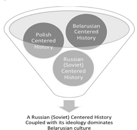
Figure 2. A Specific History Dominates